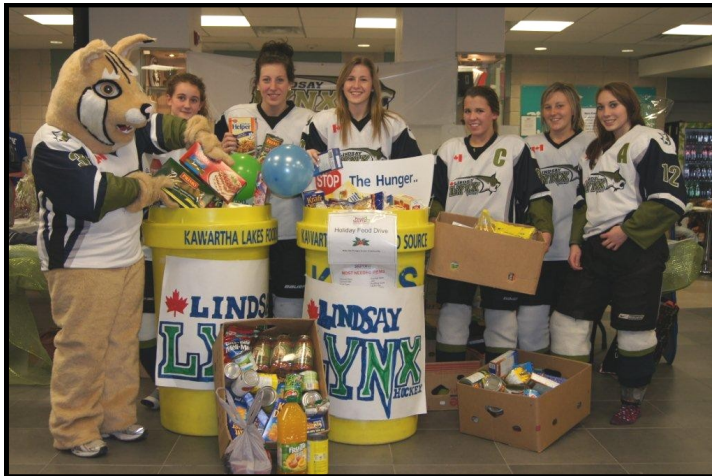
GO Lynx GO!

The annual showcase event—Lynx Day at the Lindsay Recreation Complex held a food drive and collected 404 items. KLFS is encouraged by donations from people who appreciate the work we are doing.