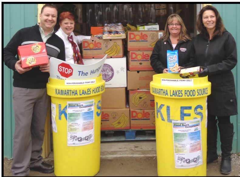
The Kawartha Lakes Real Estate Association annual food drive provided 871 non-perishable food items. Many thanks to all who participated for making a personal difference!