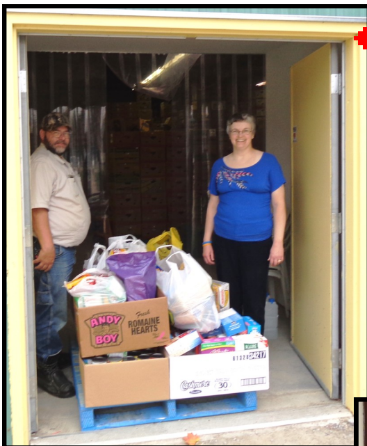
Southview Estates Community Association held their 3rd annual food drive which donated 496 pounds of food and $140.00. Many thanks!