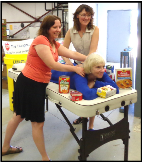
The entry fee for the "Healing for Hunger Wholistic Health Fair", presented by Inceptional Soul Services, was a donation to KLFS. Over $350 and food items were received.